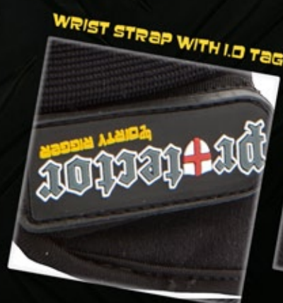
WRIST STRAP WITH I.D TAG