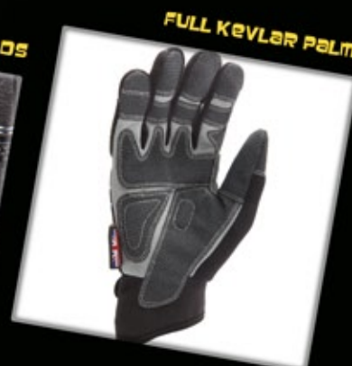
FULL KEVLAR PALM