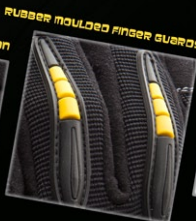
RUBBER MOULDED FINGER GUARDS