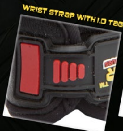
WRIST STRAP WITH I.D. TAG