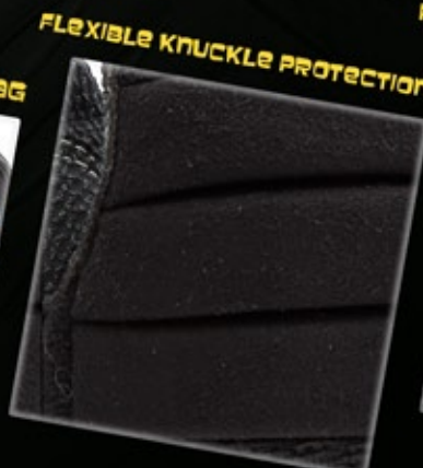
FLEXIBLE KNUCKLE PROTECTION