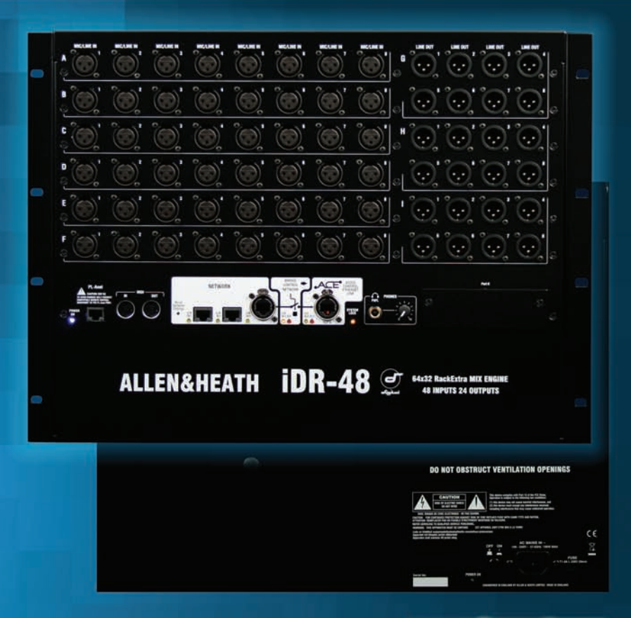
Port B: Audio Network Options

The iDR rack and T surface are connected over a single CAT5 cable up to 120m long using Allen & Heath's proprietary ACE™ digital snake - an affordable, point-to-point multi-channel bi-directional audio and control link. An option slot allows a plugin card to be added for more audio networking possibilities, such as digital mic splitting, audio distribution and digital recording. The MixRack can also be controlled using a networked PC or laptop running iLive Editor software, MIDI, the Allen & Heath PL Series of remote controllers, and, it is fully compatible with the surfaces from the flagship iLive range.